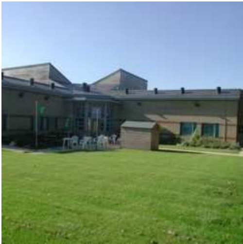
Central court of the unit