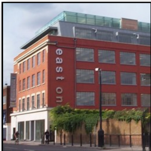
The front on Commercial Street