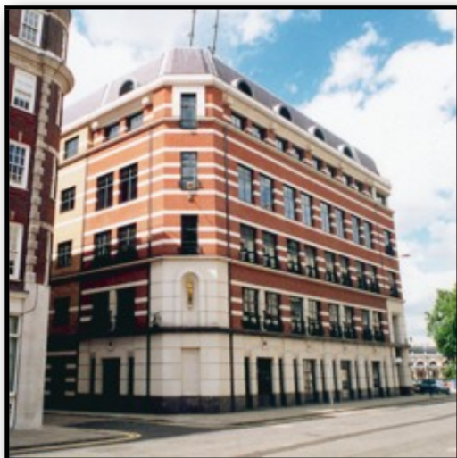
The Golden Boy at the corner of Cock Lane