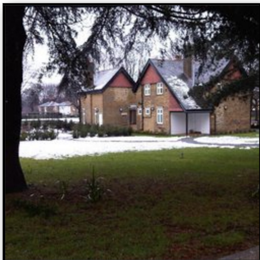
The lodge besides the underground mortuary