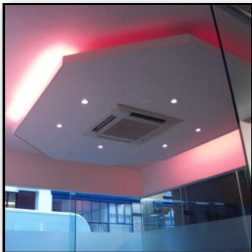
The ground floor meeting room