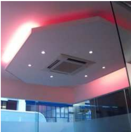
The ground floor meeting room