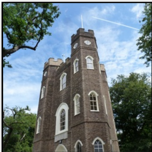
The exterior of the folly