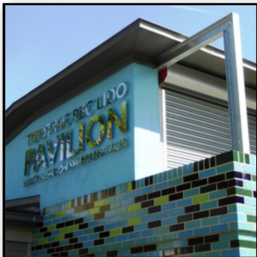
The exterior of the new pavilion